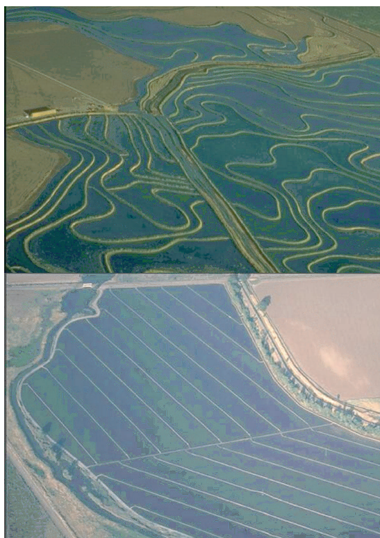
Figure 1. Typical contour levees required in unleveled land, above. Land leveled to uniform slope with parallel levees, below.

Much of the Central Valley is naturally fairly level, ranging from two to five feet of fall per mile (Willson 1979), so not much leveling was done in the early days of the rice industry. Consequently, most early efforts towards field improvement were in clearing native vegetation and building irrigation water structures such as canals, drains, weir boxes, and levees. The prevailing belief at the time was to leave the soil surface between the levees alone because rice grew poorly in cut areas and rank in fill areas. By the mid-1920s, growers began to see the economic benefits of leveling, although the first heavy earth movers and landplanes capable of major land formation were not available until 1935 (anonymous, 1948). Leveling became widespread after WWII, with a sharp increase in the 1960s. A key concern was whether to maintain the natural contours, which was cheaper, or to make the slope uniform so straight levees could be used, but at a higher cost (Figure 1). Wick (1970), estimated an equipment efficiency gain of 12-15%, 10% higher yield, faster initial