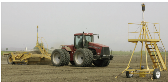
Figure 2. Typical scraper for leveling equipped with laser receiver that guides position of cutting blade. Signal is received from laser beam on stand in foreground. Scrapers may be equipped with single, dual or satellite guided receivers

the only crop, fields were specifically developed for rice using permanent levees and little or no slope. Today, a high percentage of rice fields are laser leveled and have parallel levees. Those which do not are usually in areas where rice is rotated with other crops.