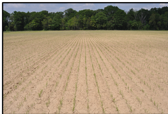
Figure 4. Drill seeded rice field before permanent flood.

flooded the water has to be drained resulting in high tailwater losses. Dry seeding can use less water if rice seed is planted to moisture which reduces the need to flush the field (or number of times field is flushed) in order to germinate the seed and establish the crop.