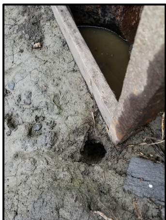
Figure 2. Leak near outlet caused by crayfish.

Fix leaks. Leaks around outlet boxes or in levees can result in significant water loss. These leaks can be caused by water erosion, crayfish, or rodents. Fields should be routinely monitored for such leaks and leaks repaired.