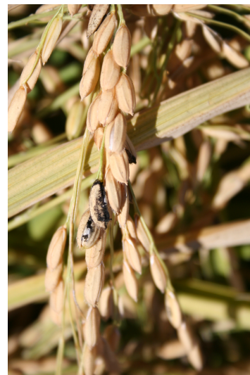
Figure 1. Panicle showing smutted kernels. Smutted kernels are more noticeable early in the morning.

and later form secondary sporidia. Secondary sporidia are discharged into the air and infect ovaries of open rice flowers. The pathogen then develops inside the flower and forms the black mass of spores evident as the grain matures (Fig. 2). Smutted kernels are more noticeable early in the morning because they swell with the morning dew.