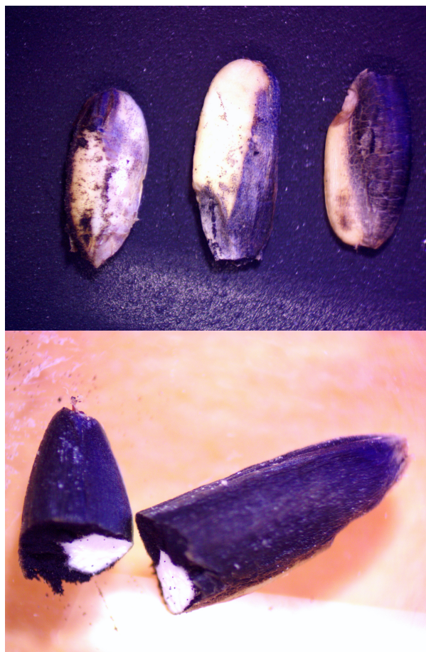
Figure 2. Smutted kernels break during the milling process, resulting in lower milling and head rice yield. Also, spores contaminate other kernels, producing off-colored milled rice.

Excess nitrogen increases the susceptibility of plants to the disease. Apply nitrogen to maximize yield and assess the need of a mid-season nitrogen application.