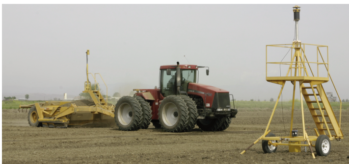
Figure 2. Typical scraper for leveling equipped with laser receiver that guides position of cutting blade. Signal is received from laser beam on stand in foreground. Scrapers may be equipped with single, dual or satellite guided receivers

some equipment operations and eliminating the need to set a complex matrix of grade stakes. With the adoption of the laser and its exceptional accuracy, growers changed their view of how flat fields could be.