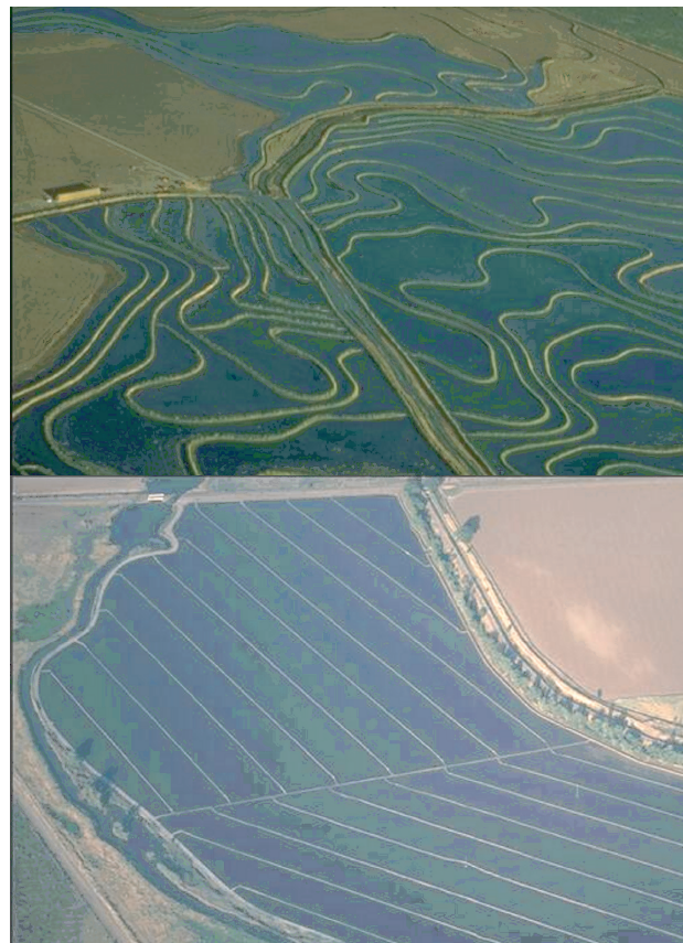
Figure 1. Typical contour levees required in unlevelled land, above. Land leveled to uniform slope with parallel levees, below.